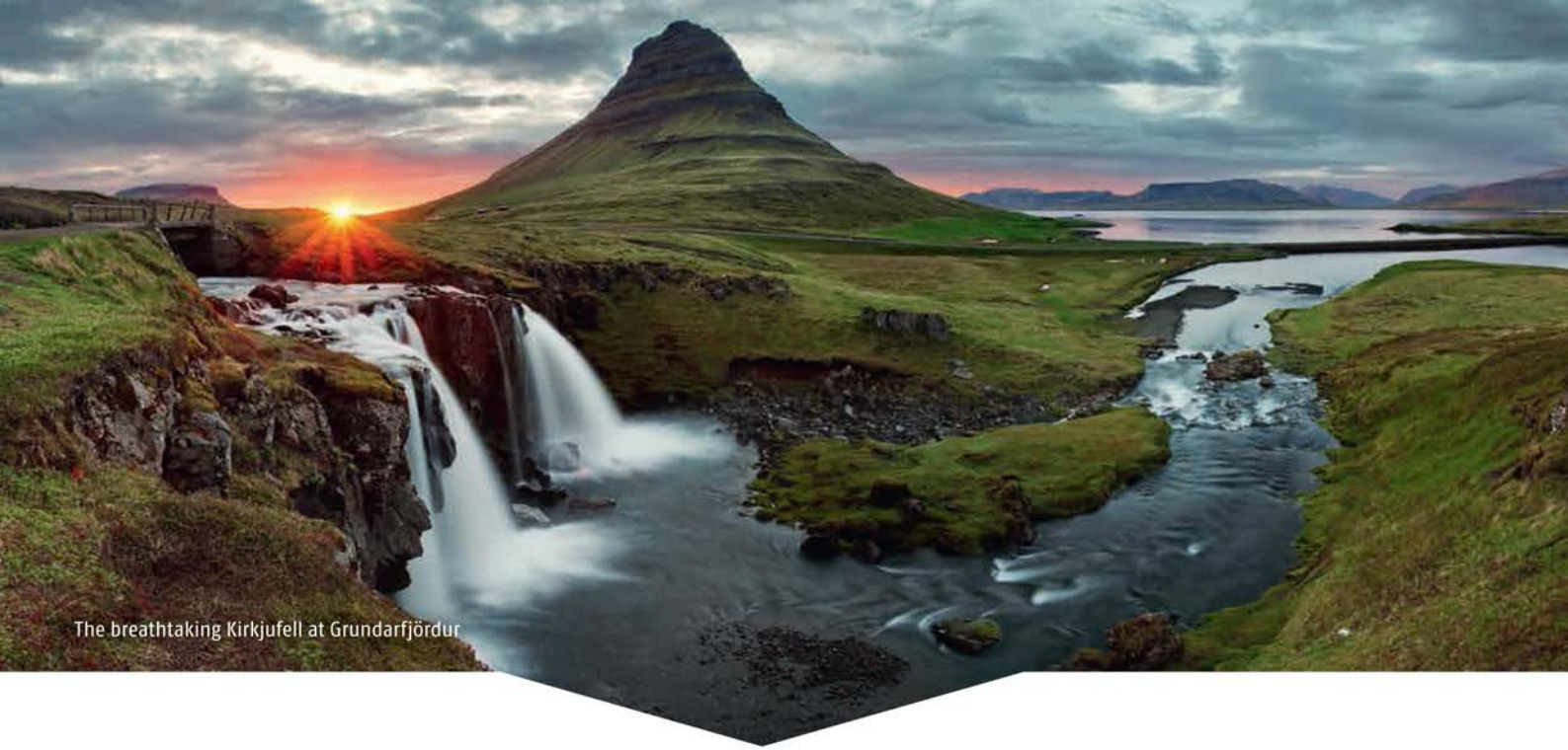
The breathtaking Kirkjufell at Grundarfjörður