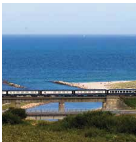
Chase Spain's coast on El Transcantabrico Gran Lujo

► Feeling lucky? As we're overnighing in Santander, perhaps you'll join us for a flutter in the city casino after dinner on board?