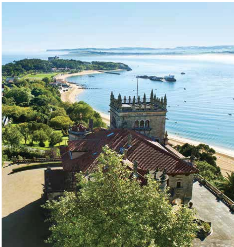
Take in the impressive panorama over the Bay of Santander